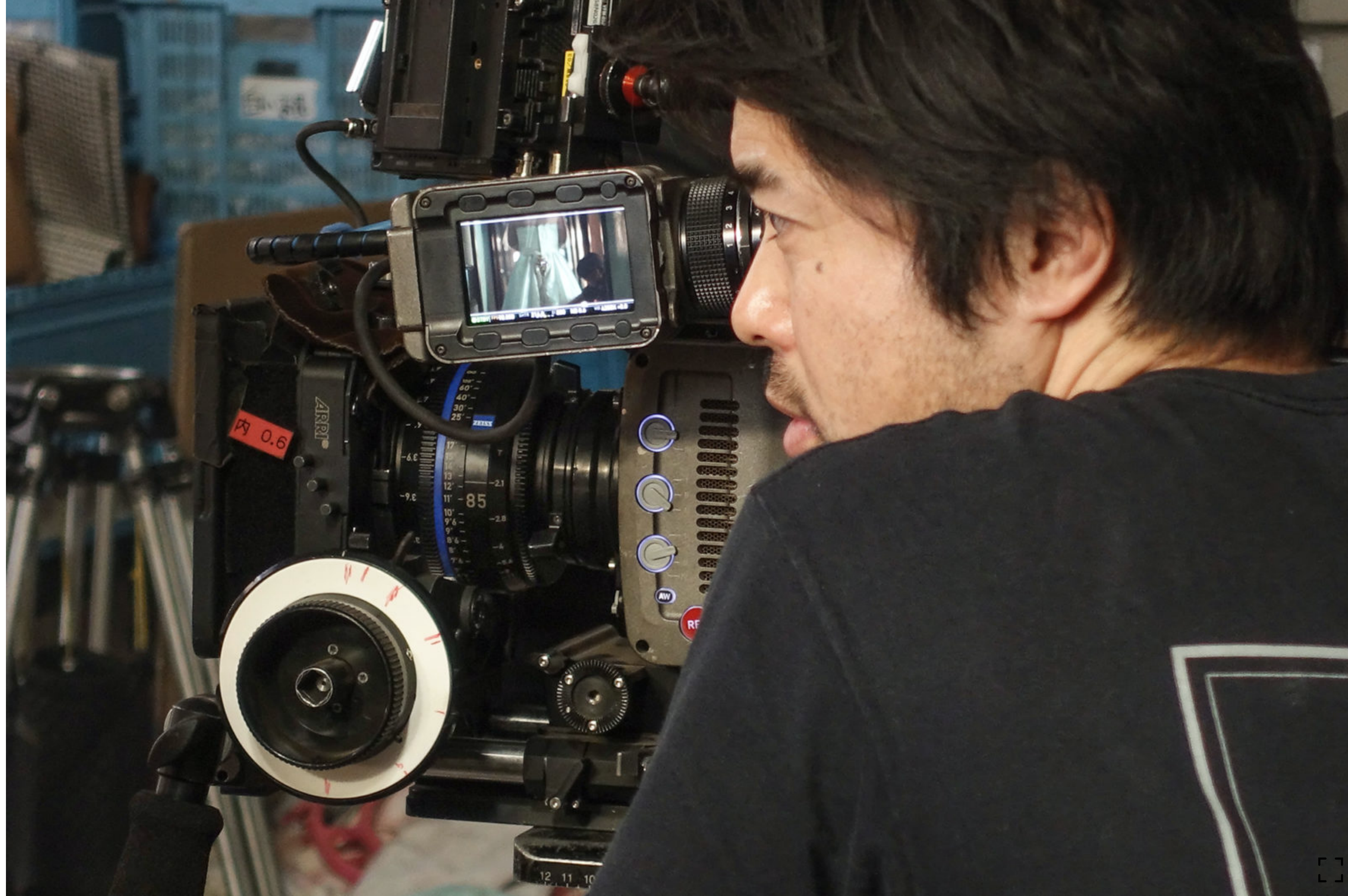
Using ZEISS CP.3 85 mm to get a bit tighter head shot of the actors.

"I trust ZEISS cine lenses because I see a consistency in clarity and tones across lens families, which helps to reduce post production workload. I would say this (CP.3 & MP) is a practical combination to meet the budget while not sacrificing the cine looks which comes from smooth, long focus throw and controlled flares."