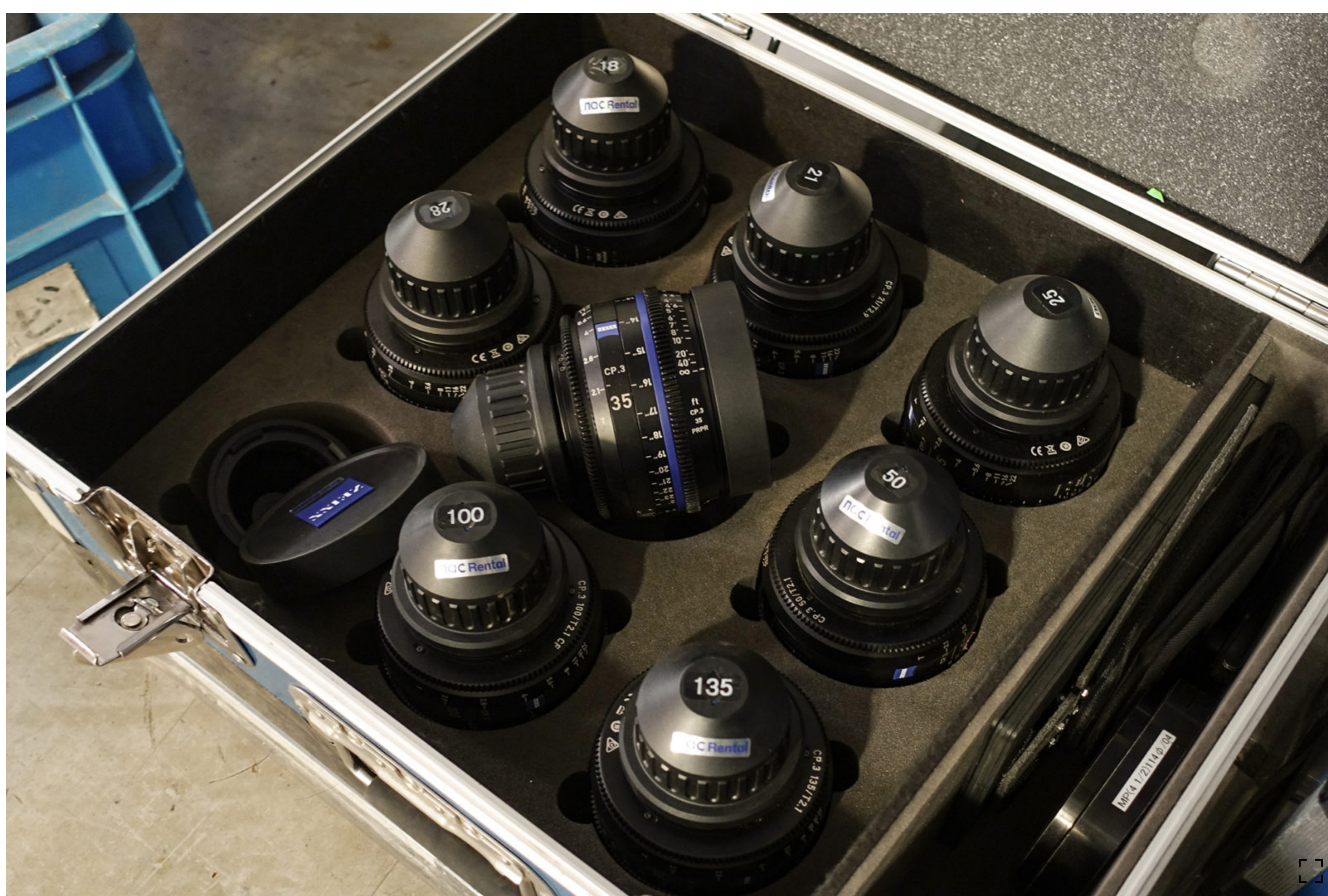
Due to its compactness, the ZEISS CP.3 lens set can be stored in one case.

As for lenses, he picked eight CP.3 lenses from 18 mm to 135 mm, plus two ARRI/ZEISS Master Prime lenses - 40mm and 65mm - which are not in the CP.3 range.